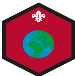
My World Challenge