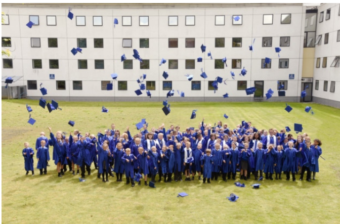
Norfolk Children's University Graduation.

Young People collect hours and then receive certificates for reaching certain milestones (30 hours for Bronze, 65 hours for Silver and so on)