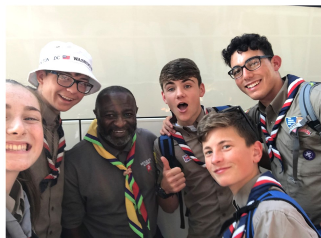
Photographs from the 24th World Scout Jamboree